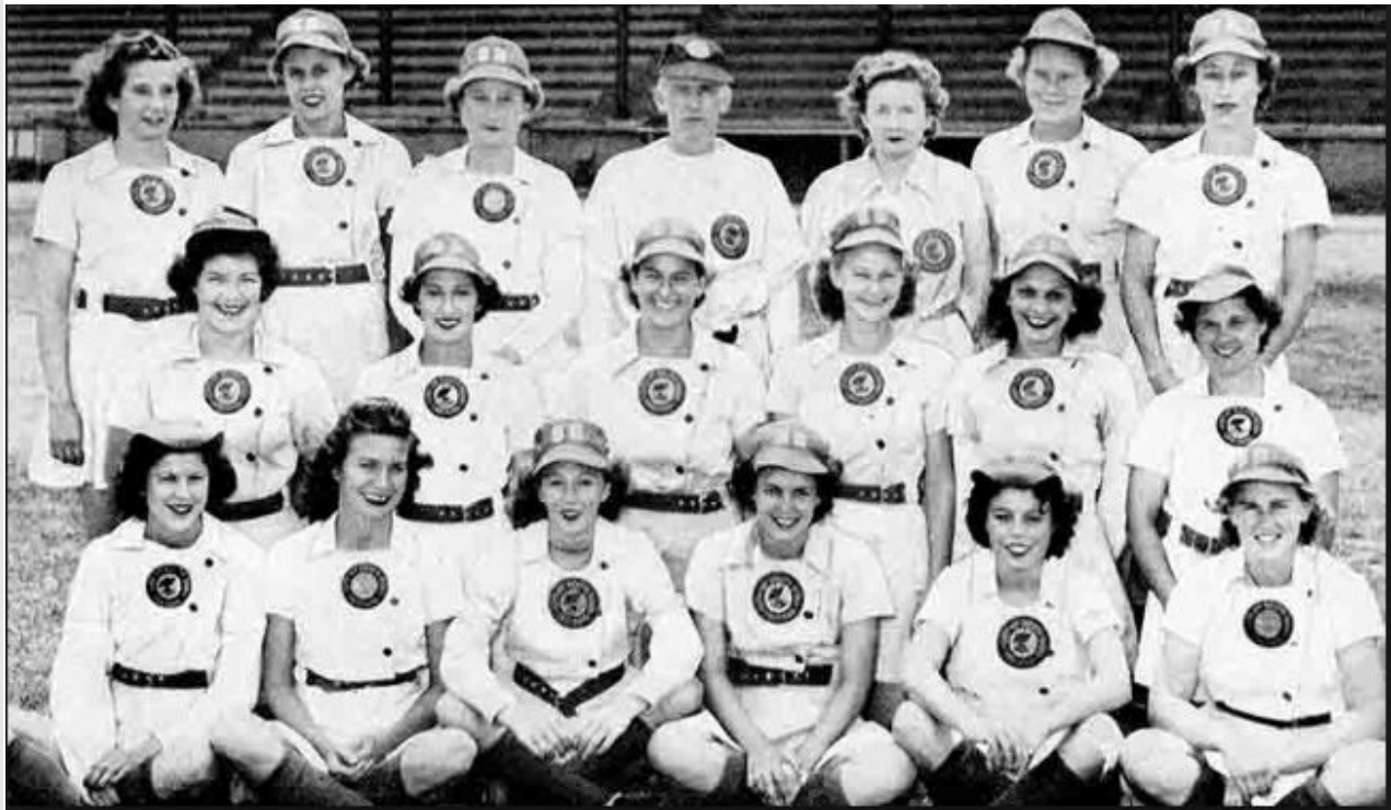
The 1946 South Bend Blue Sox Team.